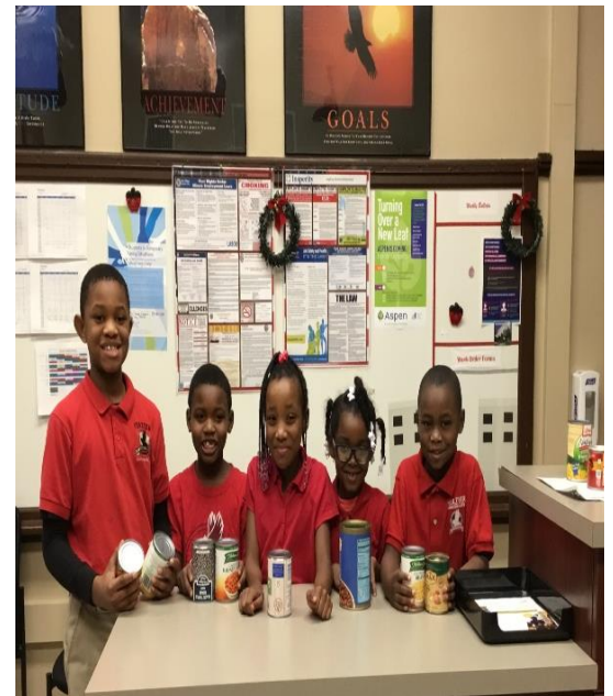
FPA SCHOLARS participate in the Holiday Donations for a local food pantry. Scholars displayed those acts of kindness by bringing "Canned Goods for Candy Canes". Thank you everyone who contributed to this school wide initiative.